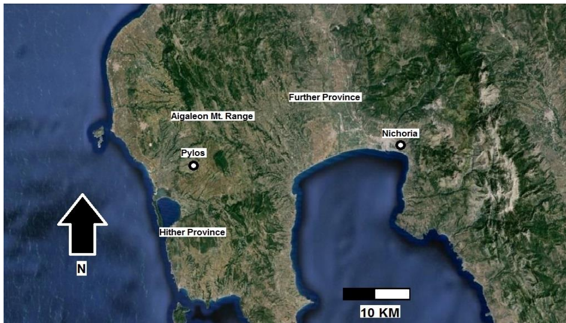
Figure 2 – Map of Messenia

significance of martial prowess in Mycenaean society would lend credence to the theory that the Mycenaean states expanded into the Aegean. Whilst it is likely that Mycenaean state(s) had the military capability to attack Phylakopi, there are doubts over whether Mycenaeans settled en masse at Phylakopi to account for the culture change. The appearance of the Ahhiyawa in Hittite texts may also not be an appropriate indication of Mycenaean expansion across the Aegean Sea, it could only indicate an independent polity in the eastern Aegean that had become expansionist. 32 The expansion of the Pylian state in Messenia may also be an isolated case. There are also serious logistical issues with administering Phylakopi from the Greek mainland, not least of all the difficulty of communication and maintaining control in a pre-modern world. There is also no evidence of a garrison; in fact, the domestic architecture remains distinctly Cycladic, which suggests that there was no major influx of Mycenaeans to the settlement.